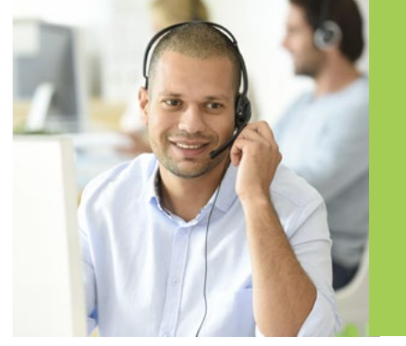
Speak to a financial advisor before making this decision to help you understand the different considerations, including tax implications related to this decision.

Important: start this process as soon as possible, because deadlines apply to most buyback situations.